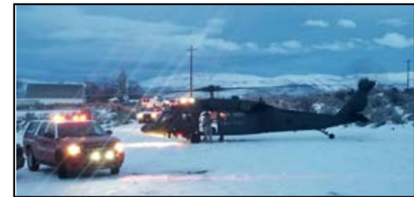
A Nevada Army Guard UH-60 Black Hawk crew delivers an injured skier to rescue crews Feb. 14 near Minden, Nev. The Nevada Army Guard helicopter was called in for support after Douglas and Alpine county rescue crews could not evacuate the injured skier.